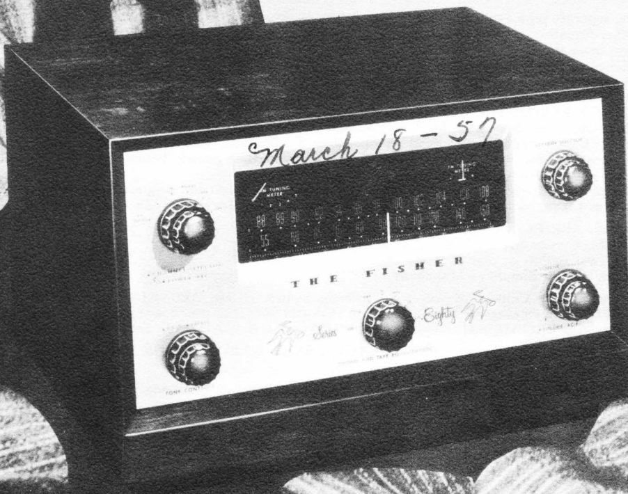
MODEL 80-T INCLUDES COMPLETE CONTROL FACILITIES